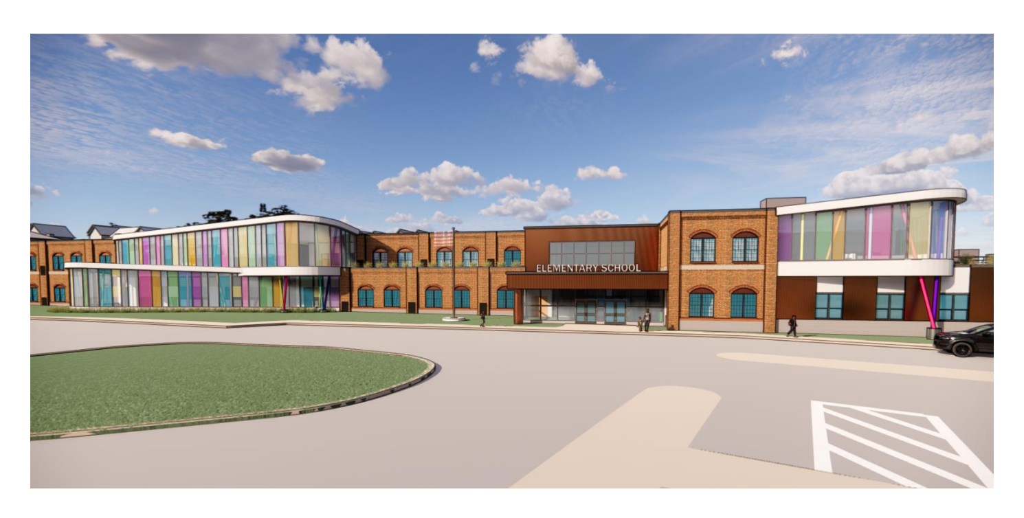
FRONT ENTRANCE VIEW