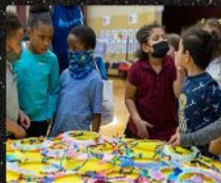
ARTWORK & ARTIFACTS