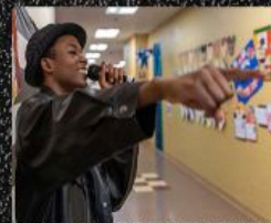
LIVING WAX FIGURES