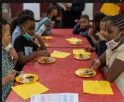
AUTHENTIC FOOD & RECIPES