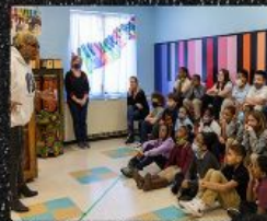
MUSIC & STORIES