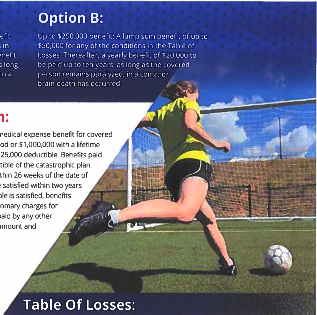
Table Of Losses:

The covered person must be under the care of a doctor when the expenses are incurred. Eligible medical expenses are listed in the policy. For a copy of the policy, please contact A-G Administrators, Inc.